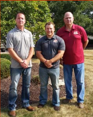
MTRMA Loss Prevention Team