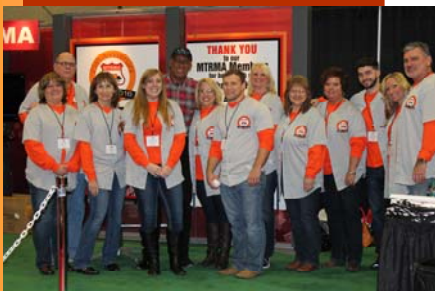
MTA Truck & Trailer Show 2016