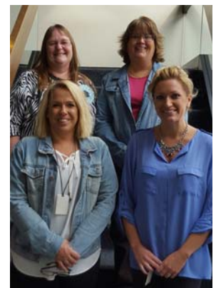
MTRMA Underwriting Team

MTRMA PO Box 1217 Danville, IL 61834-1217