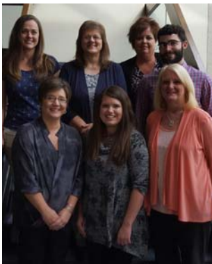
MTRMA Claims Team