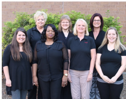
MTRMA Claims Team