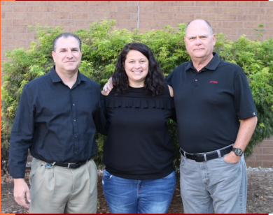
MTRMA Loss Prevention Team

Thank you to all of our members for their continued support and commitment to MTRMA!