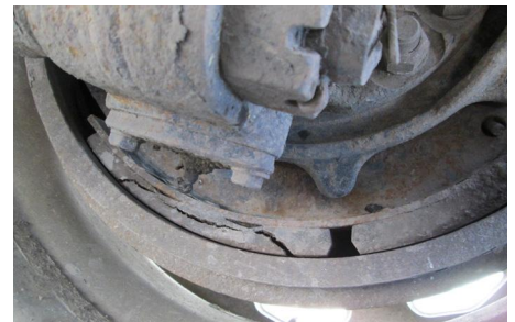
Cracked lining. OOSC, Part II, a.(5)(c)iii / 393.47(a)-U.S.