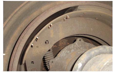
Missing lining block. OOSC, Part II, a.(5)(c)ii / 393.47(a)-U.S.