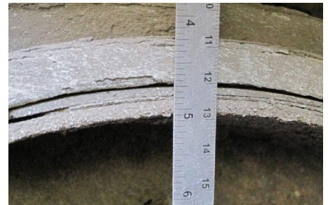
Worn out linings. OOSC, Part II, a.(5)(c)vii / 393.47(d)(2)-U.S.