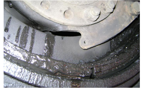
Contaminated lining. OOSC, Part II, a.(5)(c)vi / 393.47(a)-U.S.